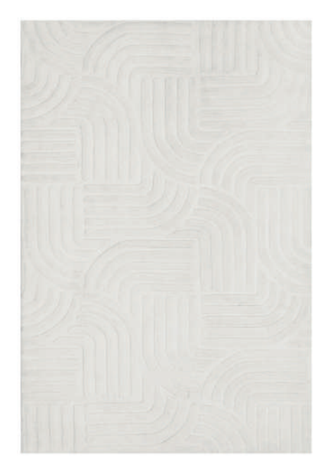
DP • ZEN WHITE