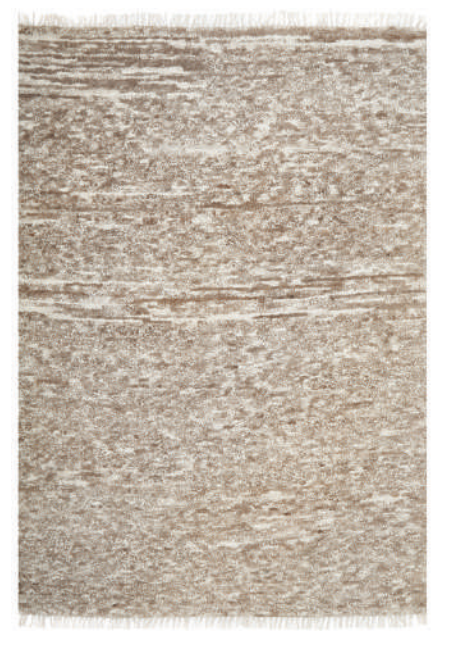
DP • TRAVERTINE BROWN