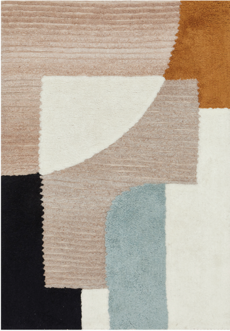
SUM • Elroy 85% Wool • 15% Cotton