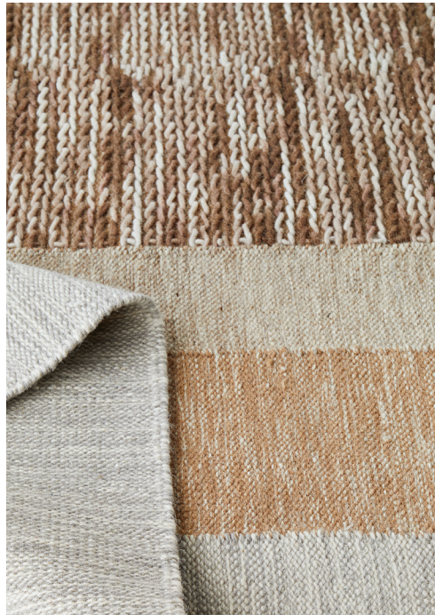
Close up of SUM Orb Toffee