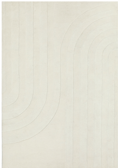
KIN • Trail White 60% Cotton • 40% Viscose