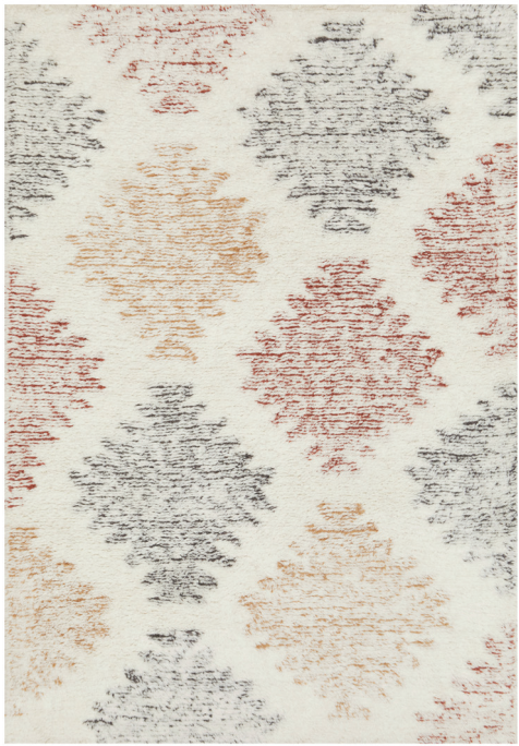
SUM • Motif Cream 70% Wool • 30% Cotton