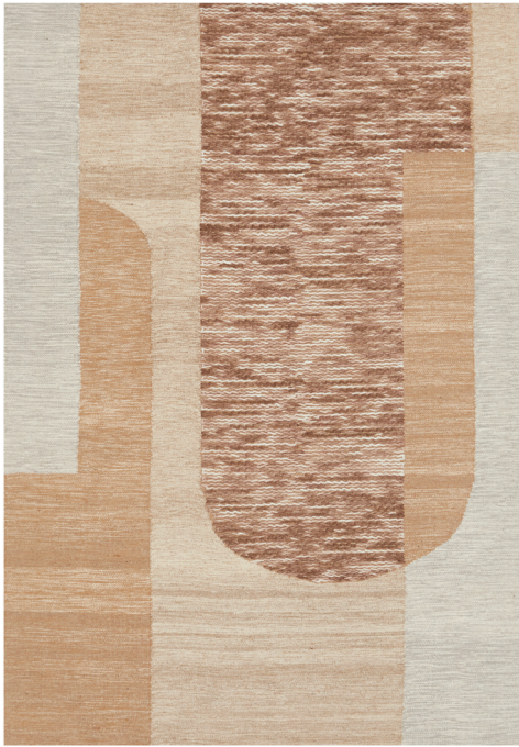
SUM • Orb Toffee 85% Wool • 15% Cotton