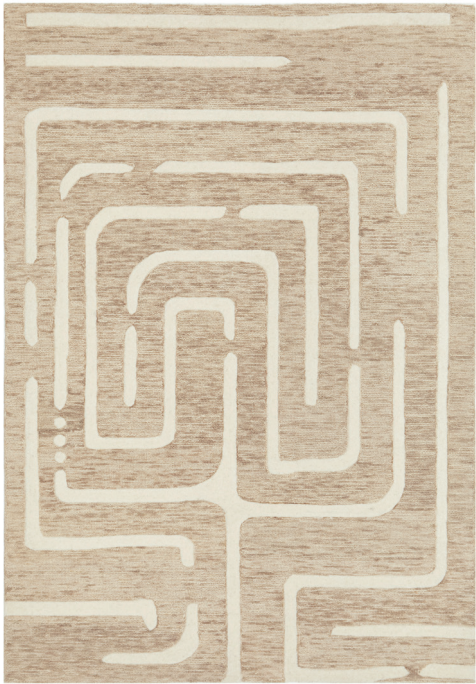
SUM • Maze Linen 100% Wool