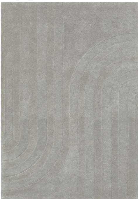
SUM • Trail Grey 60% Cotton • 40% Viscose