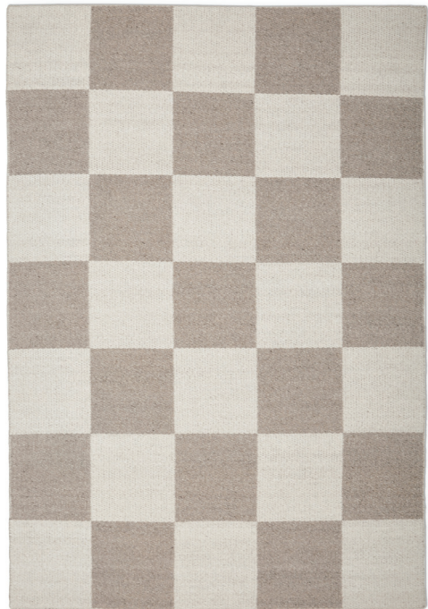
STOC • Odin