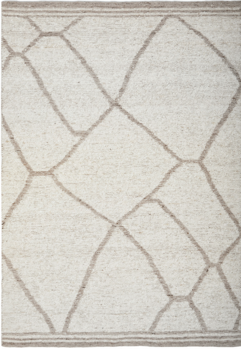
STOC • Alma