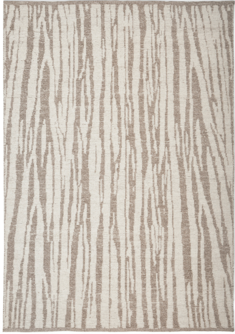
STOC • Jan