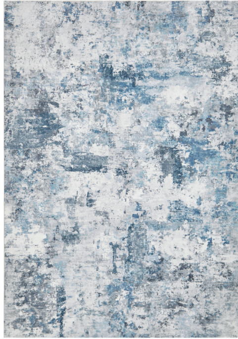
REV • Cato Blue