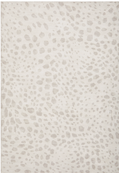
REV • Mila Natural