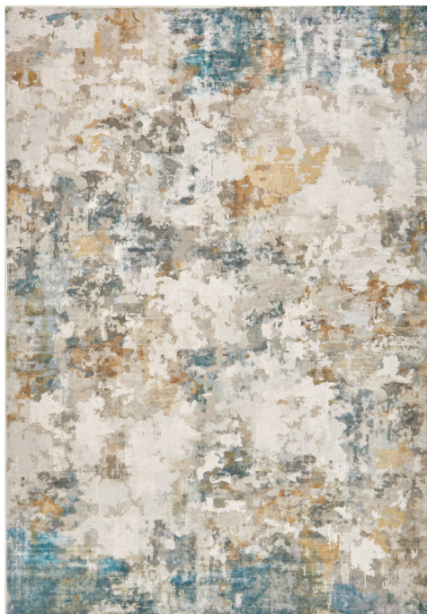
REV • Zane Marine