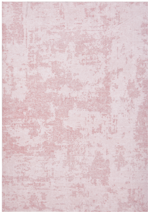
REV • Muse Blush