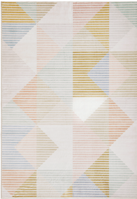
REV • Dali Pastel