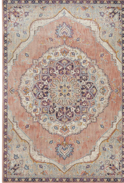
ODY - 120 - TERRA