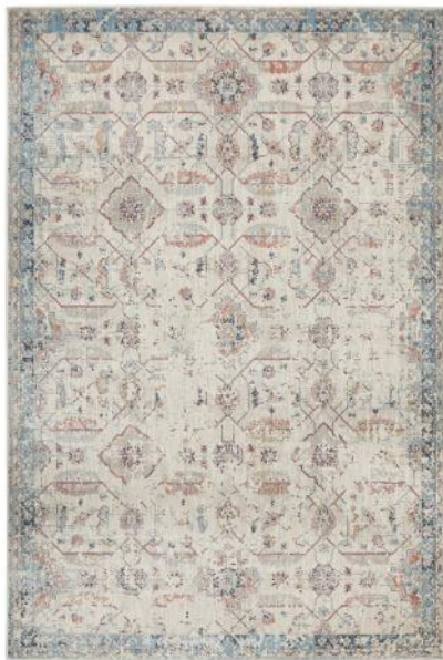
ODY - 140 - BONE