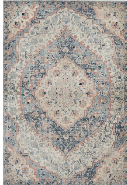
ODY - 150 - NAVY