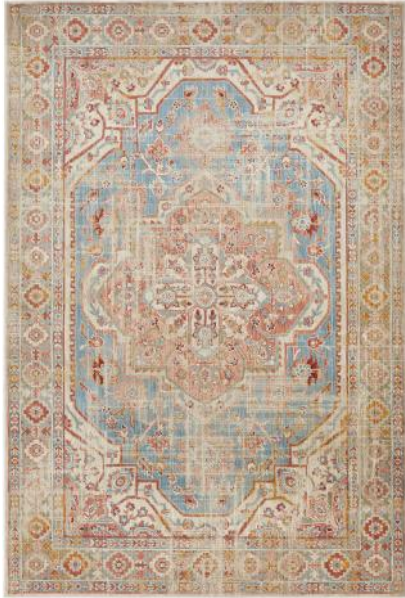
ODY - 110 - BLU