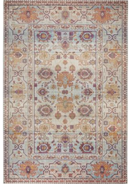
ODY - 130 - MULTI