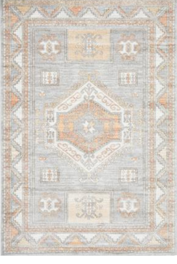
MAY - CAT - GRY