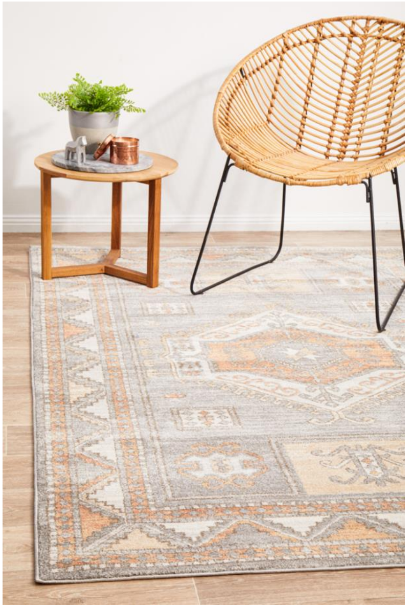
MAY - CAT - GRY

Our Mayfair Collection brings together the best of both worlds with its perfect balance of traditional and contemporary. Stonewashed Aztec motifs are beautifully accentuated by warm peachy hues and vivid ocean blues to create a stunning transitional look.