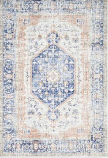
MAY - LOR - BLU