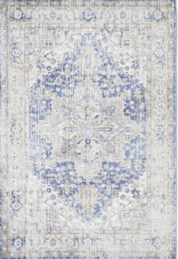
MAY - HUG - OCE