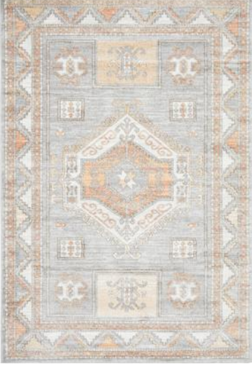
MAY - CAT - GRY