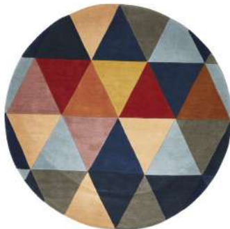
MTX - 905 - MUL