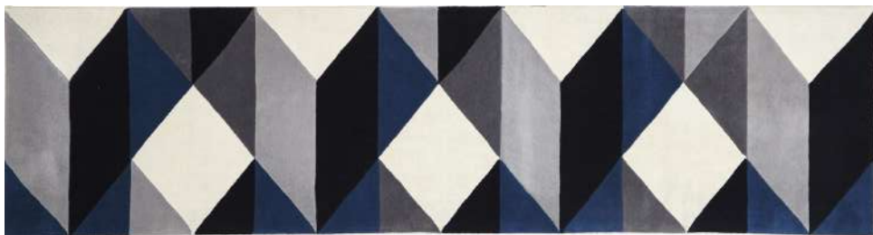
MTX - 904 - STE