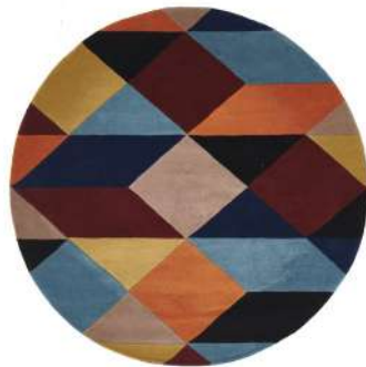
MTX - 904 - SUN