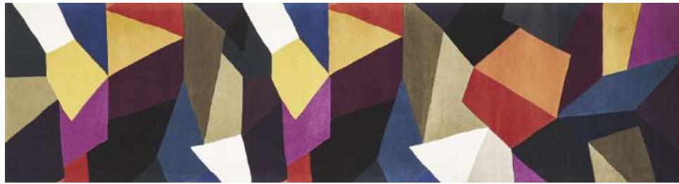
MTX - 906 - CRA

The Matrix collection portrays dazzling patterns and shapes in a huge range of colour with each piece being remarkably different to the last. Diamond, jagged and pyramid geometrics are just a few of the arrangements on offer within the Matrix collection. A hand tufted range that boasts 100% high quality wool and a luxurious 20mm pile with an array of shapes and sizes - being available in rectangular, runner and even circular ranges.