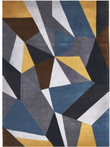
MTX - 902 - SAF