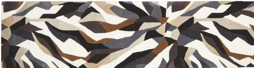
MTX - 903 - FOS