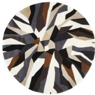
MTX - 903 - FOS