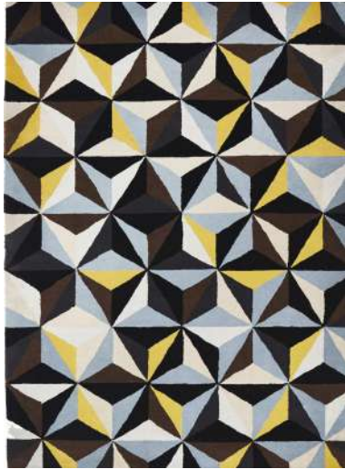
MTX - 900 - BLU