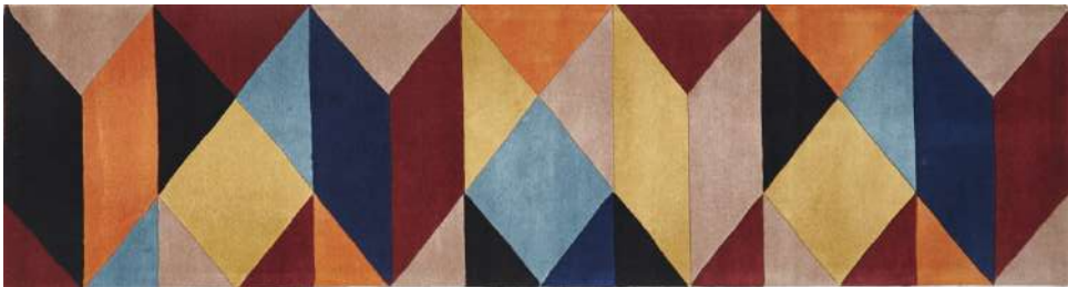
MTX - 904 - SUN