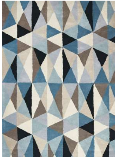
MTX - 901 - TUR