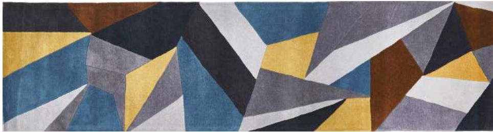
MTX - 902 - SAF