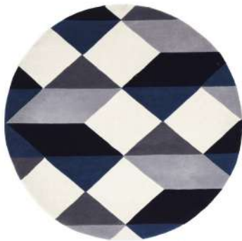
MTX - 904 - STE