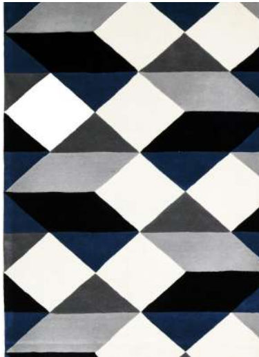
MTX - 904 - STE