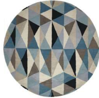
MTX - 901 - TUR