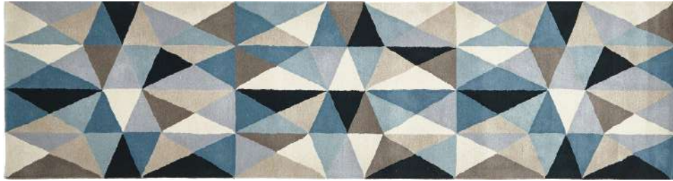
MTX - 901 - TUR