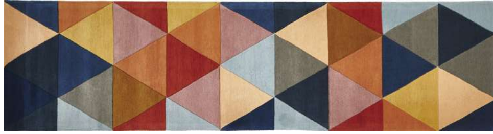
MTX - 905 - MUL