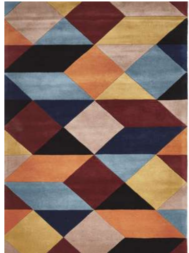
MTX - 904 - SUN