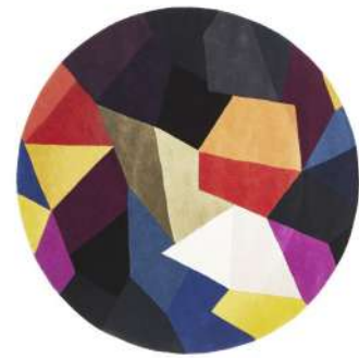
MTX - 906 - CRA