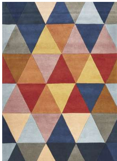
MTX - 905 - MUL