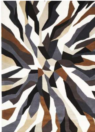
MTX - 903 - FOS