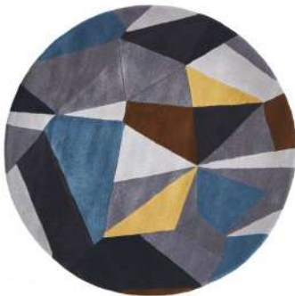
MTX - 902 - SAF