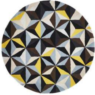
MTX - 900 - BLU