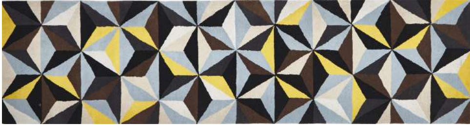
MTX - 900 - BLU