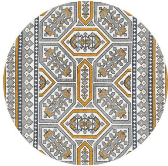
LUN - 420 - GOLD

Perfect for a variety of styling themes, Lunar is a beautiful collection of printed cotton round rugs, available in 3 great sizes. Each piece is hand woven in India and features an intricate print in vivid hues.