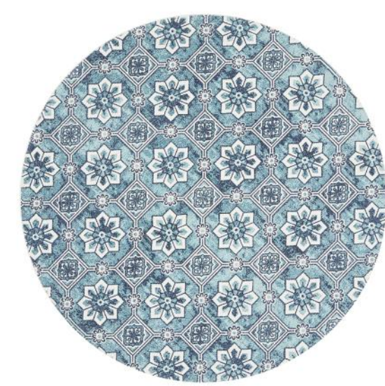
LUN - 427 - BLUE