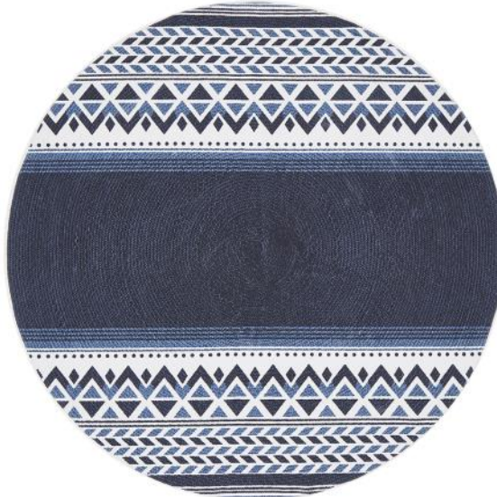
LUN - 422 - NAVY