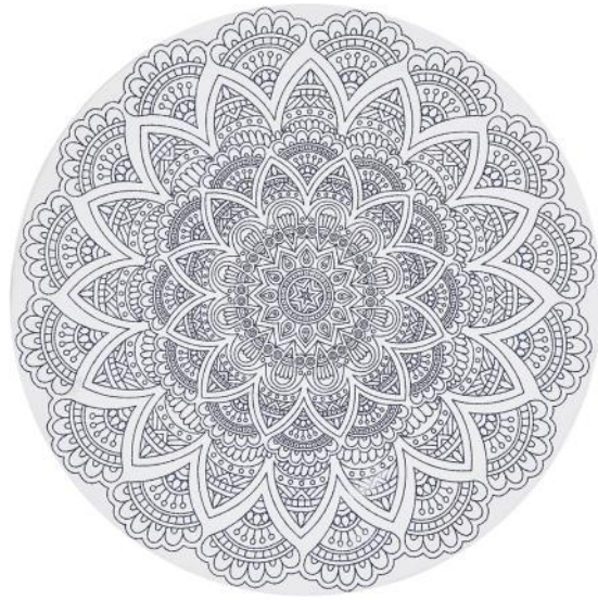
LUN - 207 - WHITE