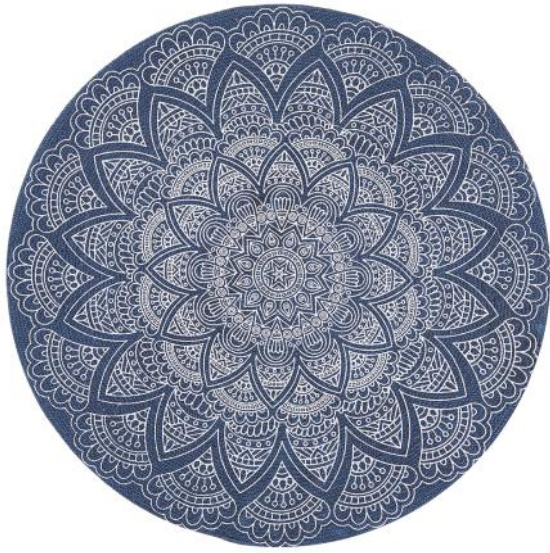
LUN - 206 - BLUE