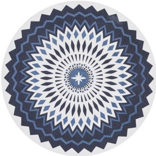
LUN - 429 - NAVY