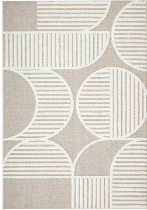
LOT • Leo Mixed 100% Polypropylene Pile