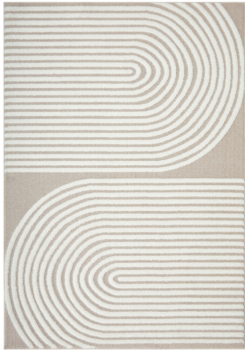
LOT • Abbey Mixed 100% Polypropylene Pile