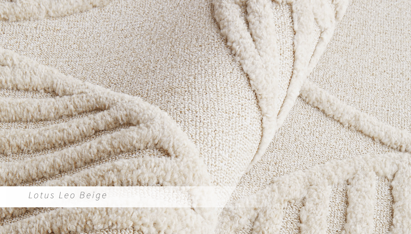
Lotus Leo Beige

Each rug in the collection is available in three chic colourways—beige, white, and a mixed palette of beige and white—offering versatility to match a variety of decor designs. The subtle interplay of colours and textures across the collection ensures that each piece can stand alone as a focal point or work harmoniously with other decor elements.