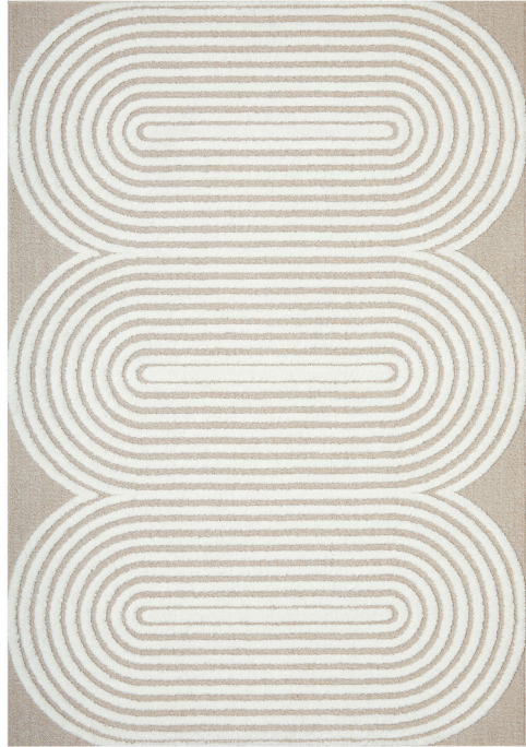
LOT • Carl Mixed 100% Polypropylene Pile