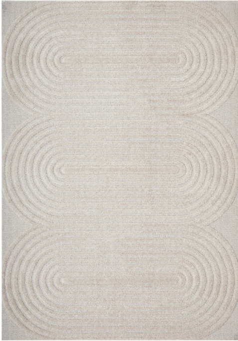
LOT • Carl Beige 100% Polypropylene Pile