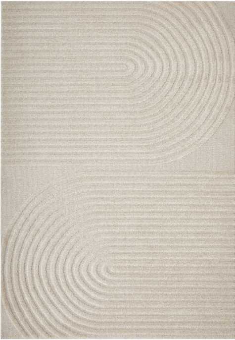
LOT • Abbey Beige 100% Polypropylene Pile