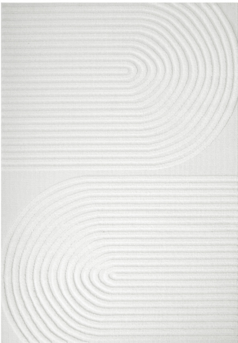
LOT • Abbey White 100% Polypropylene Pile