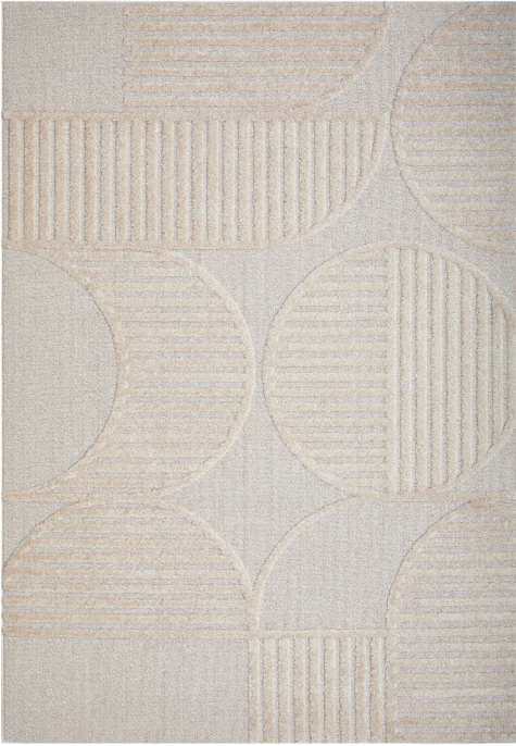
LOT • Leo Beige 100% Polypropylene Pile