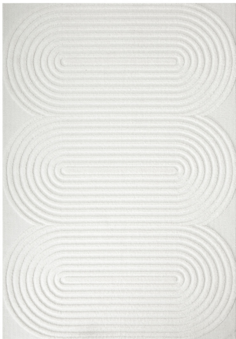
LOT • Carl White 100% Polypropylene Pile