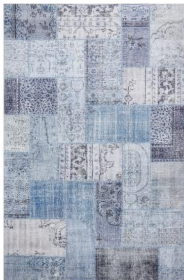
ILU - 121 - DENIM