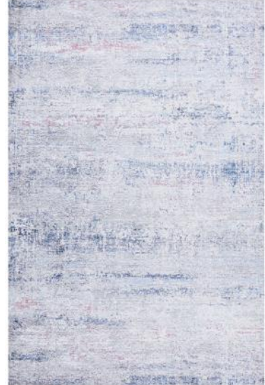
ILU - 144 - CANDY