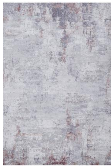
ILU - 156 - BLUSH