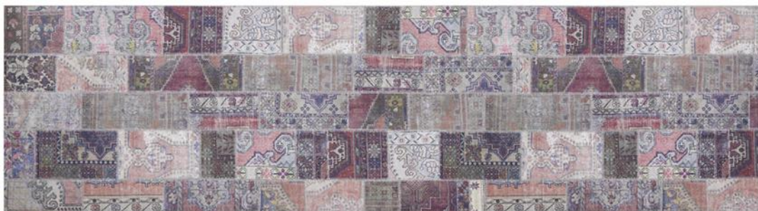
ILU - 178 - EARTH