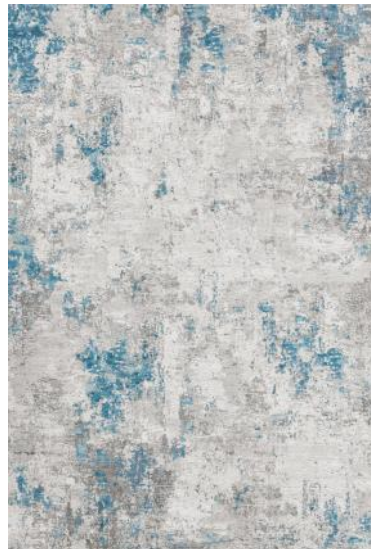
ILU - 132 - BLUE