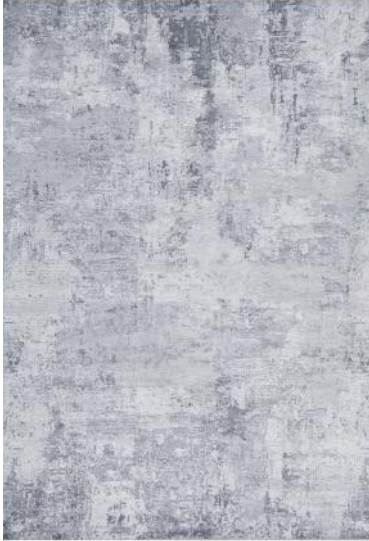
ILU - 156 - SILVER