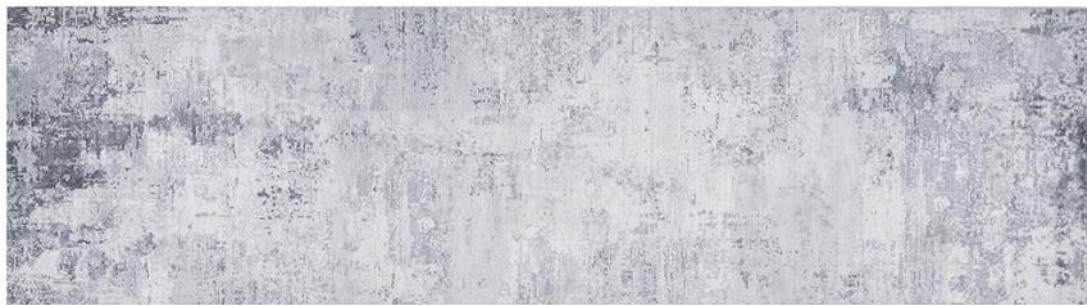
ILU - 156 - SILVER