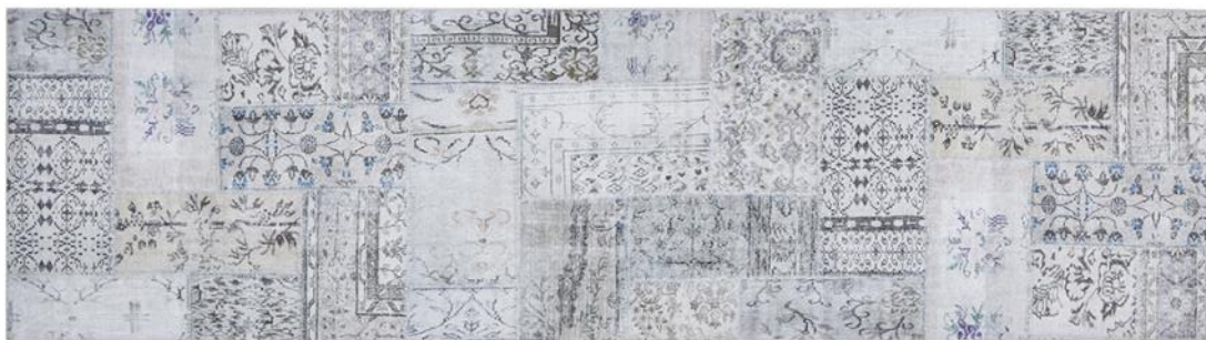
ILU - 189 - STONE