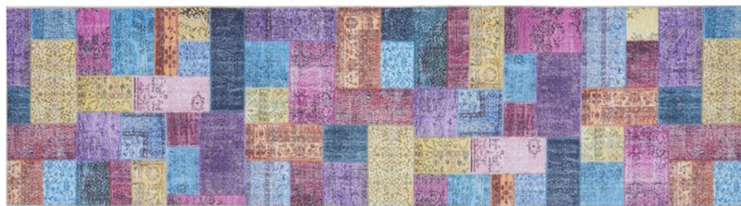
ILU - 167 - MULTI