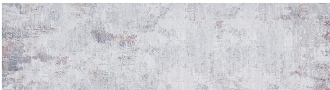
ILU - 156 - BLUSH