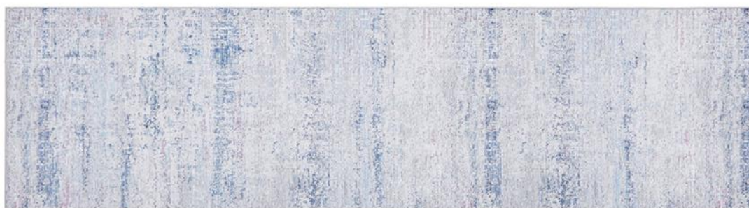
ILU - 144 - CANDY