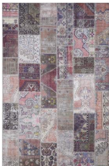
ILU - 178 - EARTH