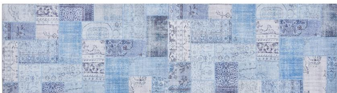
ILU - 121 - DENIM