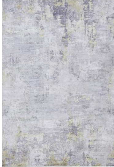
ILU - 156 - GOLD