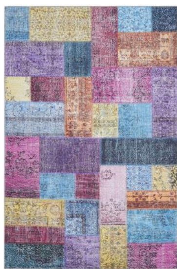
ILU - 167 - MULTI