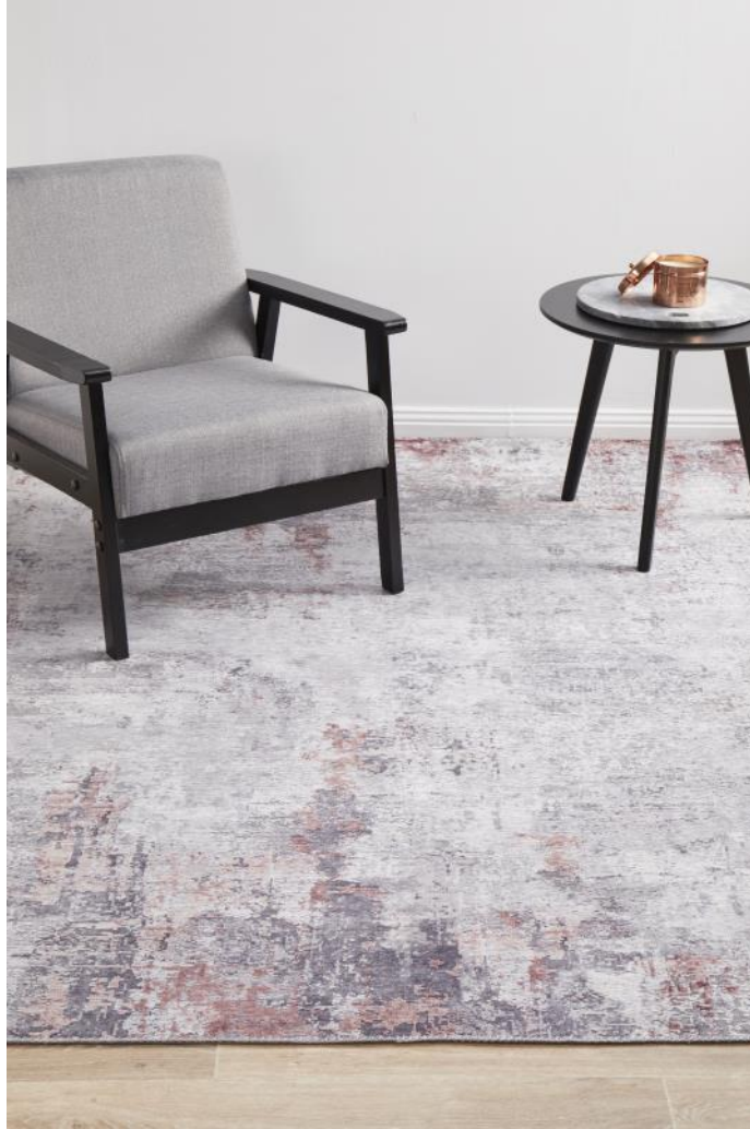
ILU - 156 - BLUSH

Fall in love with our marvelous Illusions Collection - a beautiful range of vibrant colours and playful patterns. Perfect for adding a touch of charm and character to your interior, our Illusions Collection features alluring designs that have been masterfully crafted on a soft pile of polyester fibres.