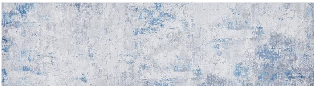
ILU - 132 - BLUE