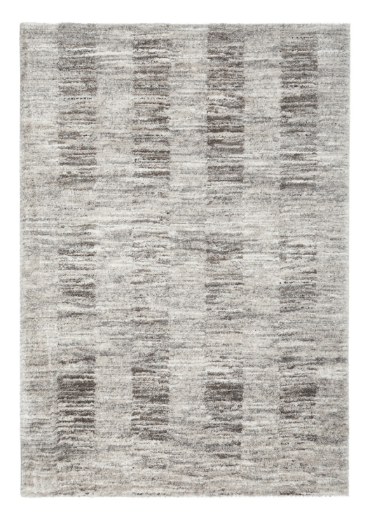
HIM • Fin Steel