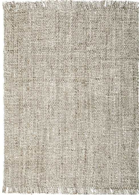
HLO • Parker Silver 100% Jute