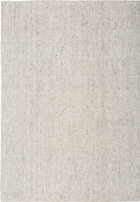
HLO • Ariel Beige 70% Wool, 30% Jute