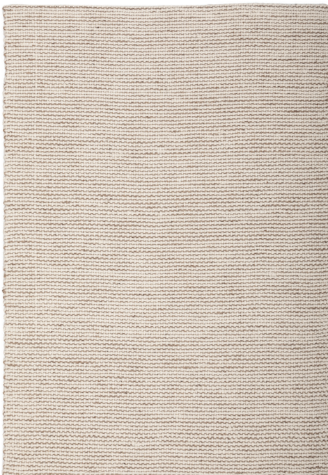
HLO • Cove Cream 70% Wool, 30% Jute