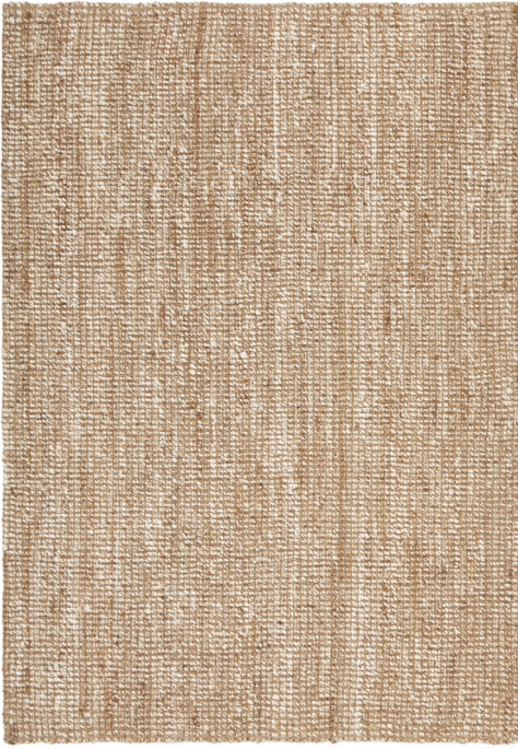
HLO • Hunter Natural 100% Jute