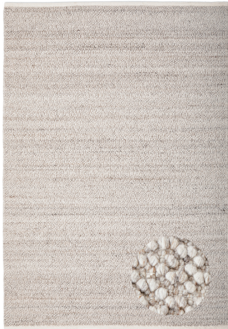
BOUCLE • Natural