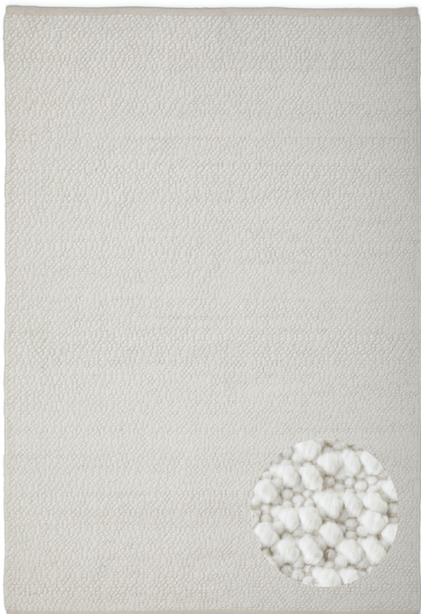
BOUCLE • White