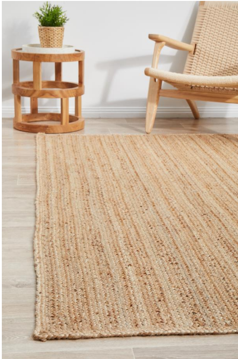
BDI - 3 - NAT

The Bondi collection is a timeless range that has been hand-braided to perfection in a stunning array of neutral and vibrant hues. Skilfully crafted in India from natural eco-friendly jute fibres to give an organic look and feel, Bondi will make a great sustainable addition to one's living or working space.