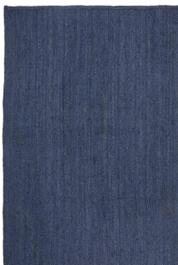
BDI - 3 - NVY