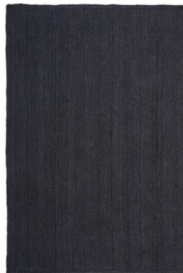
BDI - 3 - BLK