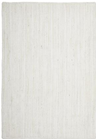
BDI - 3 - WHT