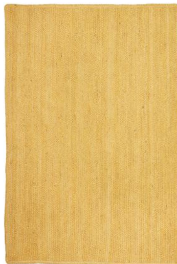
BDI - 3 - YEL