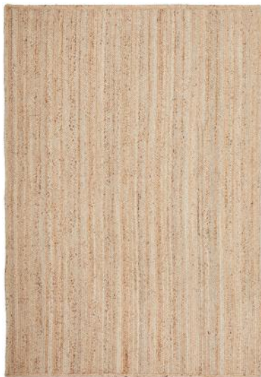
BDI - 3 - NAT