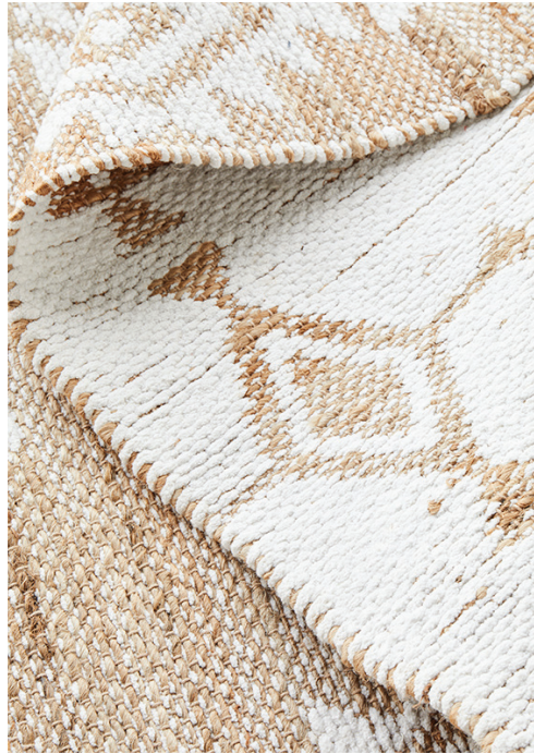
Close up of BOD Quinton