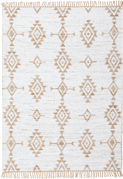
BOD • Quinton