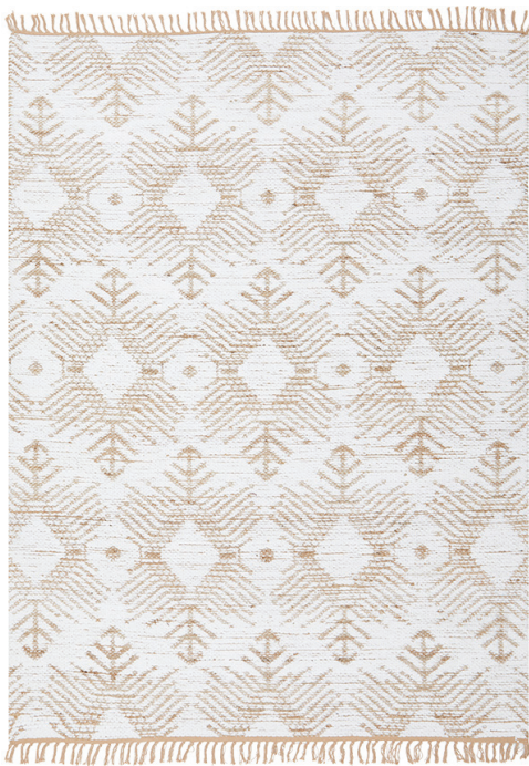
BOD • Rosa