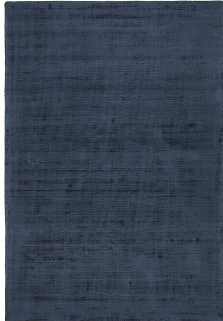
BLS - DENIM