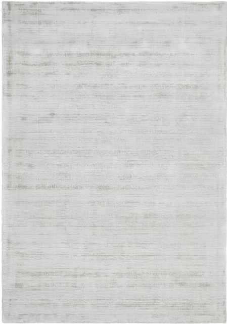
BLS - SILV