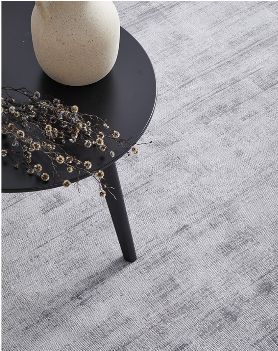
BLS - GREY

The Bliss Collection features a stunning array of luxurious modern rugs that are perfect for adding a touch of colour and charm to living areas. Masterfully constructed in India from silky soft viscose fibres, Bliss is a beautiful and versatile range that is sure to enrich a modern decor with its timeless charm.