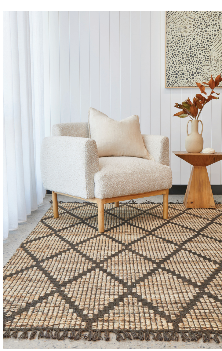
Handwoven • Jute Pile • Natural Tones • Contemporary Style Made in India