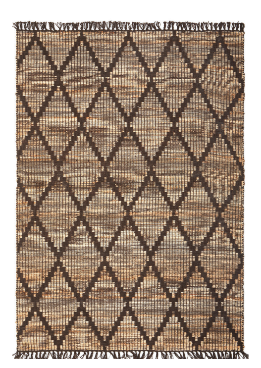
BALI • Mocha