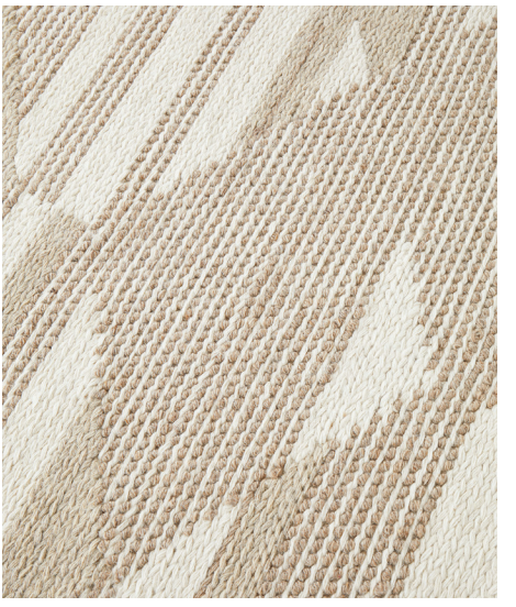
Handwoven • 6mm Pile • Made in India 70% Wool / 30% Cotton