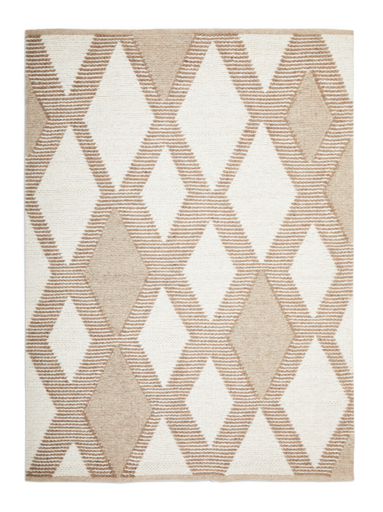
AVALON • Shelly